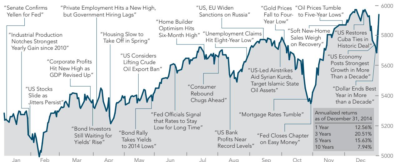
Russell 3000 Index with selected headlines from 2014