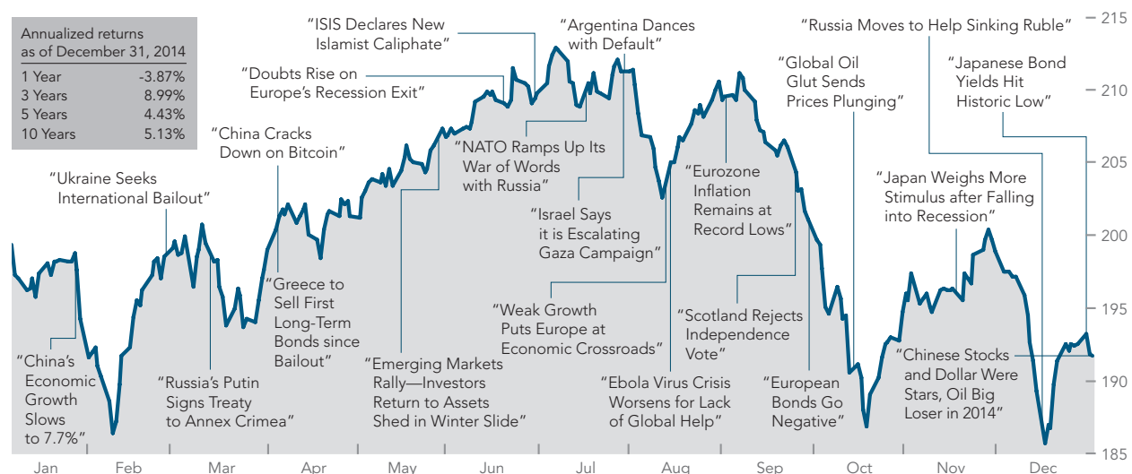
MSCI All Country World Index ex USA (net div.) with selected headlines from 2014