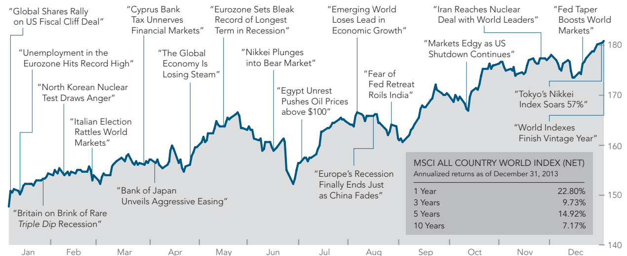
MSCI All Country World Index with selected headlines from 2013